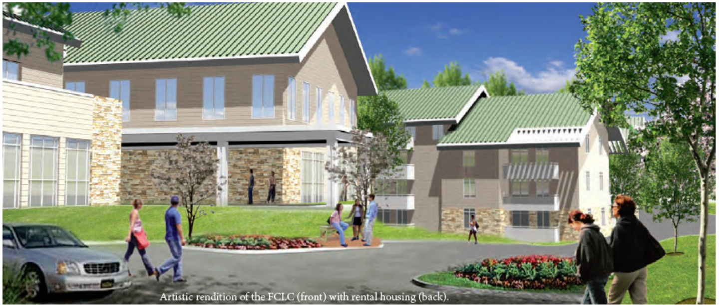
Artistic rendition of the FCLC (front) with rental housing (back).