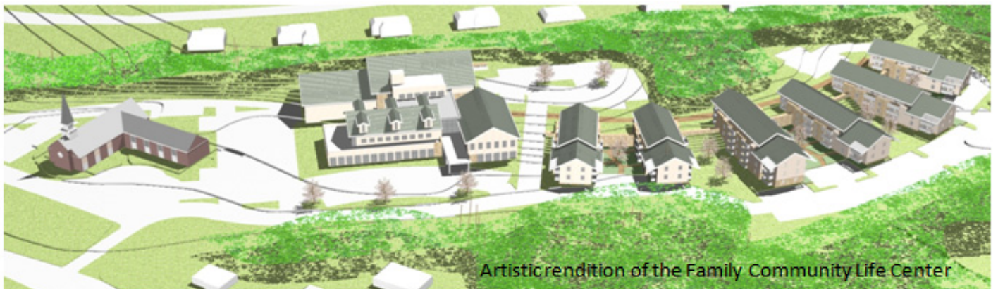
Artistic rendition of the Family Community Life Center

1018 Northville Turnpike • Riverhead, New York 11901