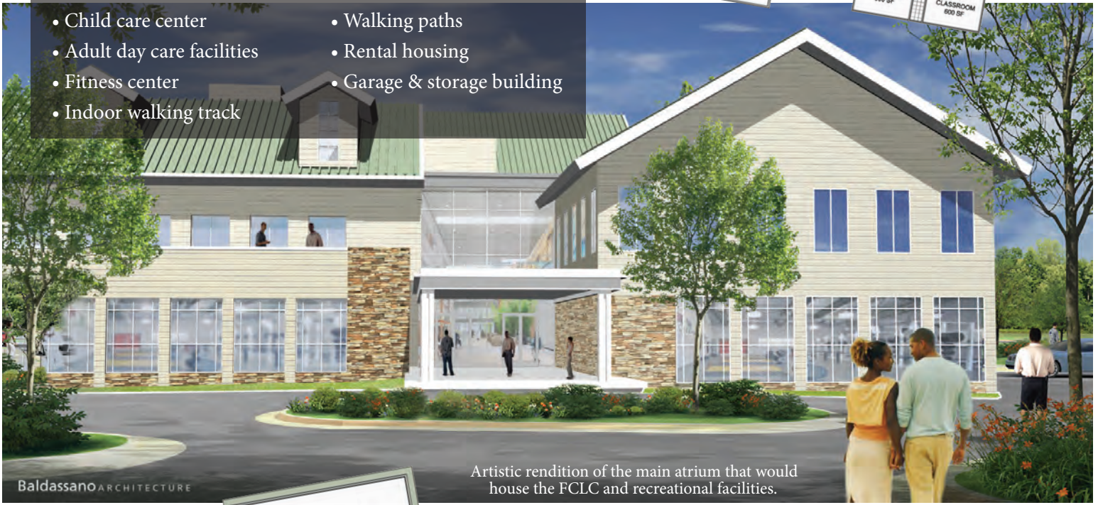
Artistic rendition of the main atrium that would house the FCLC and recreational facilities.